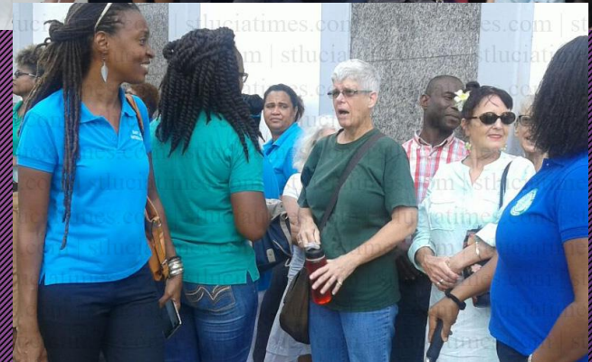
SLNT staff, members & public concerned about proposed dolphin park