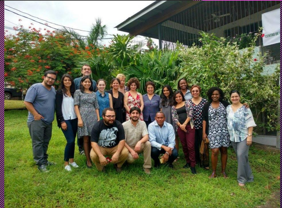
Members of the public at Preparatory Meeting at CIAM in Panama (July 13-14) ahead of the 4 th Negotiations for a Regional Agreement on Access to Information, Participation and Justice in Environmental Matters.