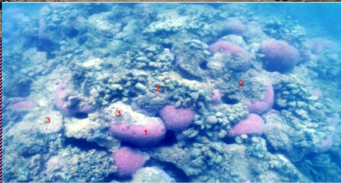
Damage to corals resulting from the incomplete La Paradis Development in Praislin, Saint Lucia